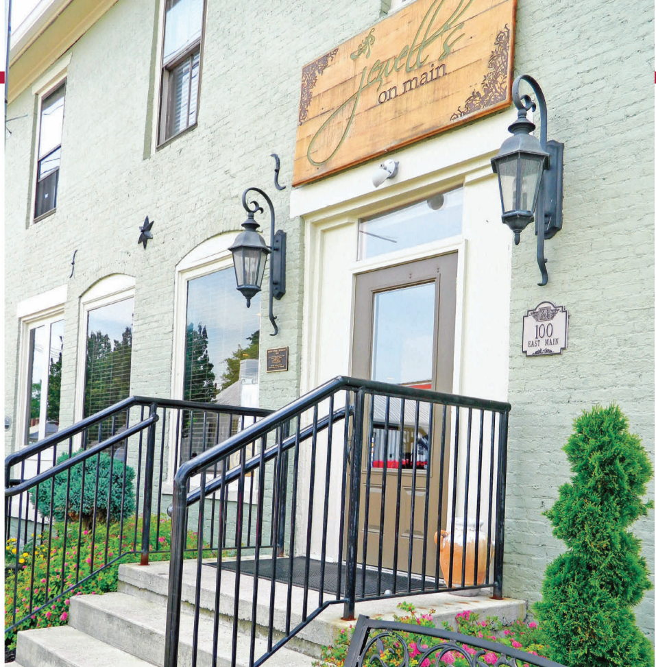
Jewell's on Main serves homestyle favorites like catfish and shrimp and grits.

“Beyond changing the menu twice a year, we have a fantastic staff that might help us expand someday,” she says. “We love our staff and our family. We never would have made the jump without them.” ■